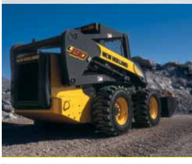
The long wheelbase and low center of gravity provide added stability on uneven terrain.

New Holland skid steers combine incredible stability with the superior reach of the Super Boom™ vertical lift linkage. The result? More lift capacity per pound of total machine weight. That means you can move bigger loads to increase productivity and improve your bottom line.