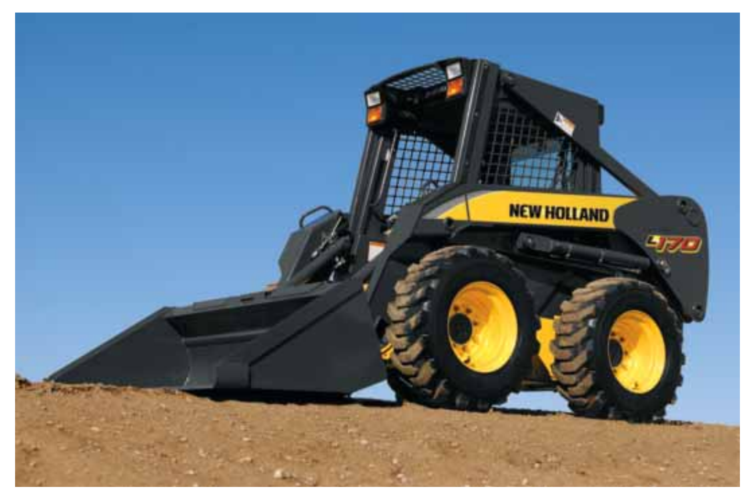
L170 with 12.00 x 16.5 tires